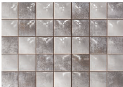
RLV. FOSTER GRAFITO 31,6x45