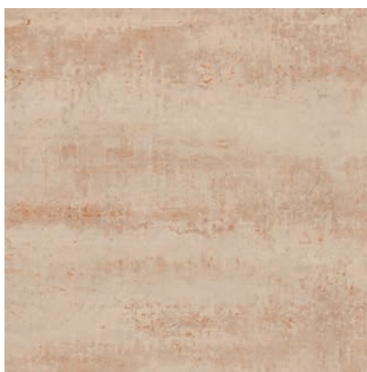
FOSTER MARRON 45x45