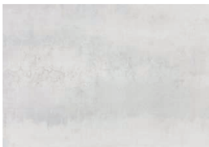
FOSTER GRIS 31,6x45