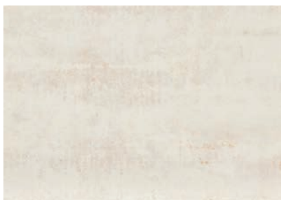
FOSTER BEIGE 31,6x45