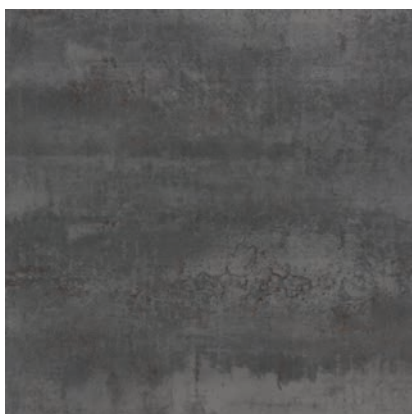
FOSTER GRAFITO 45x45