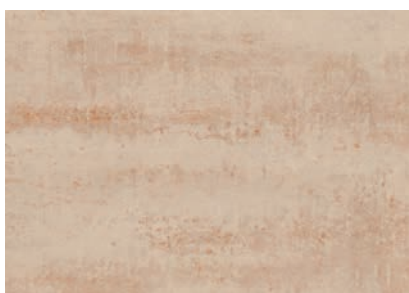
FOSTER MARRON 31,6x45